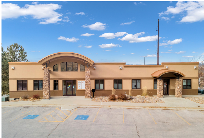
Entrance to Upper Level Suite, #1